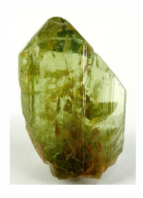
(Mg, Fe)<sub>2</sub>SiO<sub>4</sub> Hardness: 6.5-7 Color: Yellow/Green, Olive- Green, Brownish