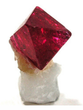
MgAl<sub>2</sub>O<sub>4</sub> Hardness: 7.5 - 8 Color: Red, pink, blue, lavender/violet, dark green, brown, black, colorless