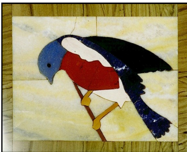
Tuscarora Lapidary Society, Intarsia Lapidary and Jewelry Arts